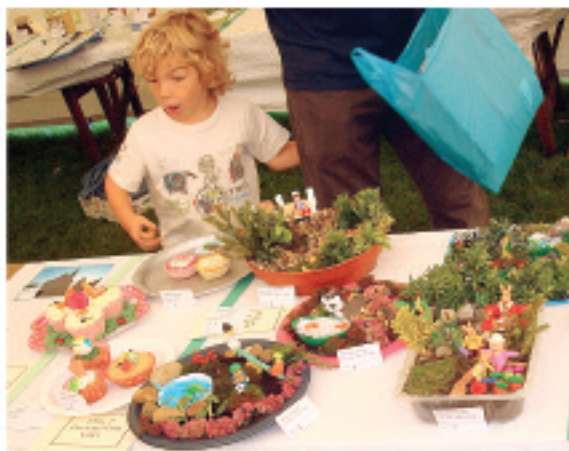
"They look tasty!"