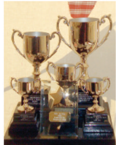
Top right: Horts Cup; other cups given by Bugle