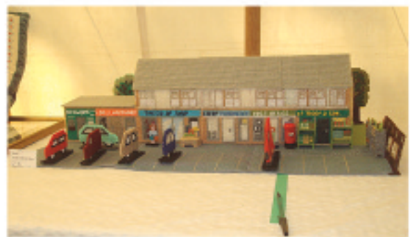
Embroidered shops in Hunters Way