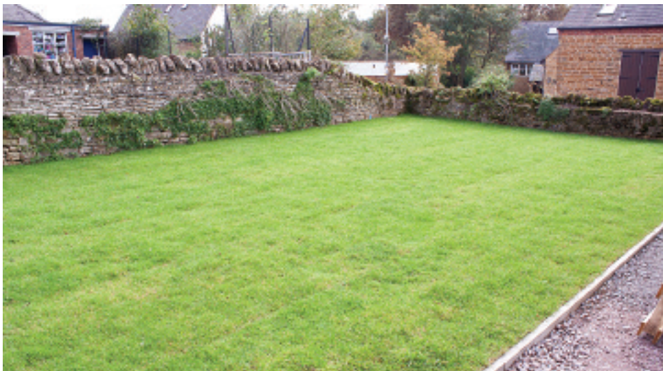
The old cracked concrete surface of the playground is now replaced with attractive turf and a gravel path at the side

Jane Smith of N.C.C. expects that the building work will be complete by the end of January 2011, but occupation will not be achieved until the beginning of spring