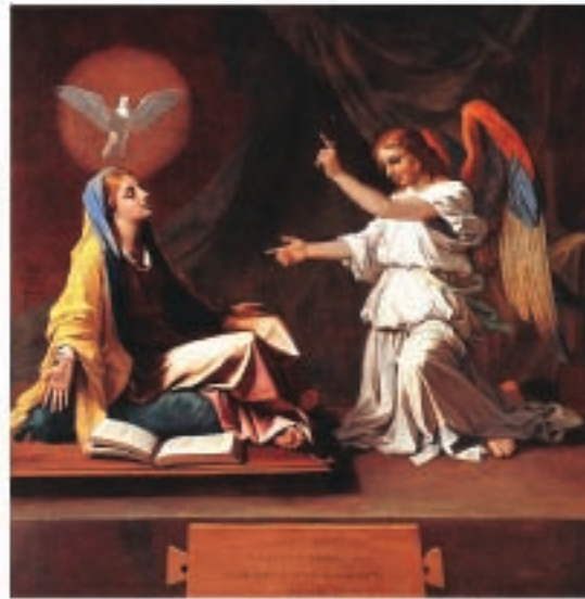
'Annunciation' by Nicolas Poussin, 1657 National Gallery, London

7.45 a.m. Holy Eucharist (first Sunday of the month) 10.00 a.m. Sung Eucharist & Address 6.00 p.m. Evensong